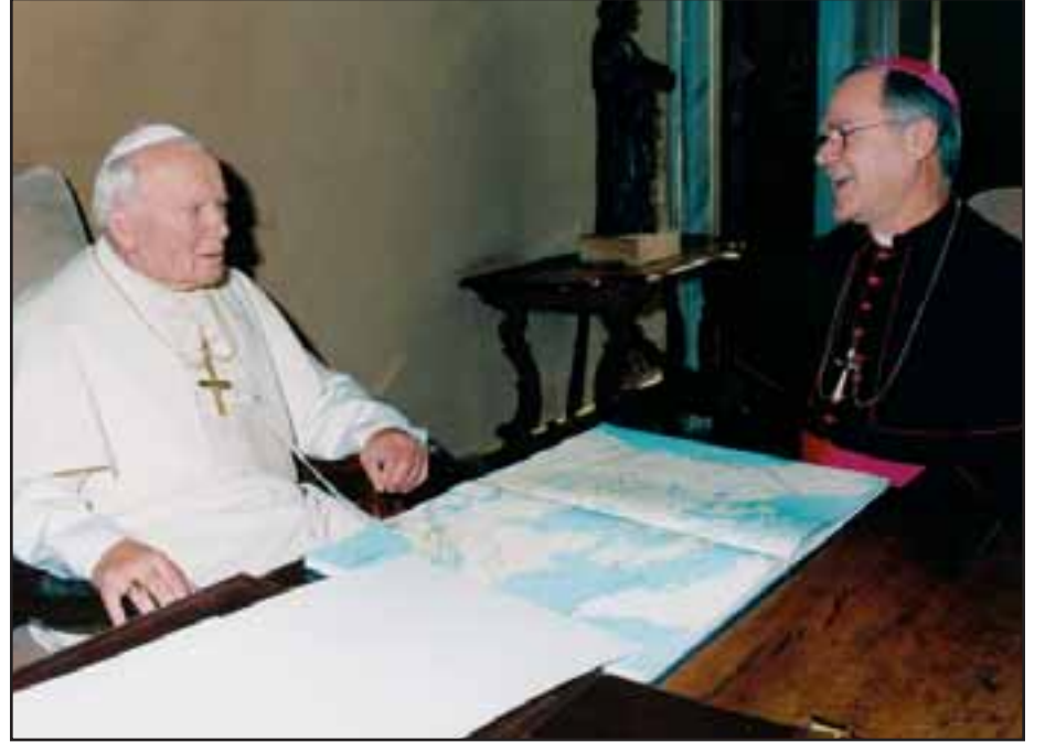
With Archbishop Weisgerber in the Pope's private apartment in Rome