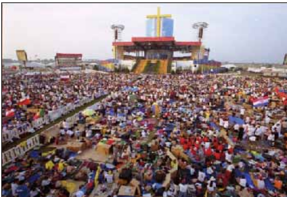
Pope John Paul II's love for young people was apparent as thousands gathered at World Youth Day in Toronto to see him