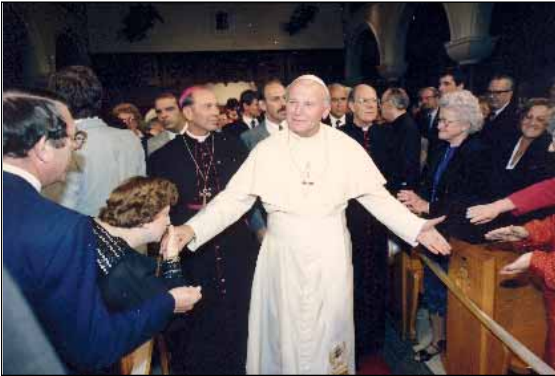
At St. Mary's Cathedral, September 16, 1984

The Archdiocese of Winnipeg remembers the Holy Father