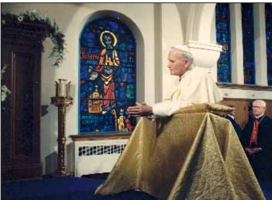
A moment of reflection at St. Mary's Cathedral

During his visit to Winnipeg in 1984, Pope John Paul II prayed the Angelus at St. Mary's Cathedral. Following are his words on that occasion: