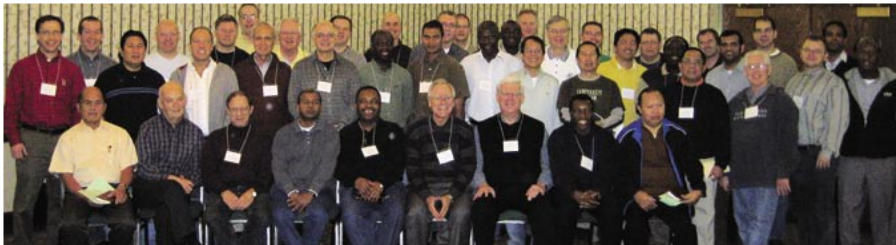
'Building the Prairie Church Together' was attended by 42 international and local priests at Elkhorn Resort in Riding Mountain park.